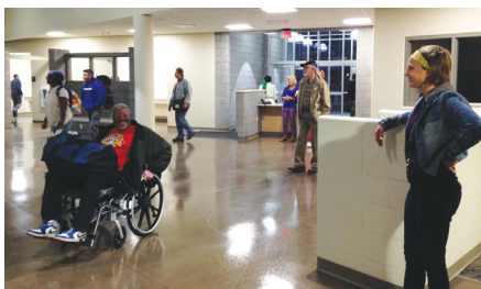
Members entering the building for the first time on opening day, September 15, 2016.

At 6:30am on September 15, 2016, every staff member at Ministry with Community stood in the Commons Area of our brand-new facility at 500 North Edwards Street. Full of excitement and anticipation, we unlocked the doors and welcomed our members in for the first time. As the space filled, there were smiles, cheers, fists raised in joy, hugs, and high fives. In that moment, the hard work that went into fundraising, designing, and constructing the new building was all worth it.