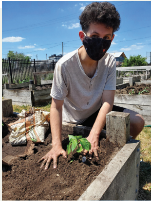
A Kalamazoo College student plants one of the seedlings their volunteer group grew for us.

Check out a few of our favorite photos from this Summer's garden below. And if you're hungry for more, follow us on Facebook and Twitter for regular updates.