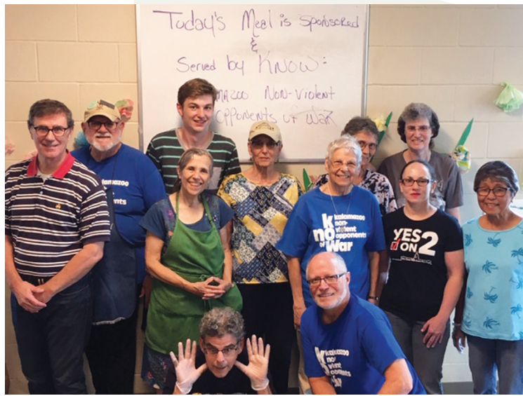
The Kalamazoo Non-Violent Opponents of War sponsored and served a meal on August 17th.