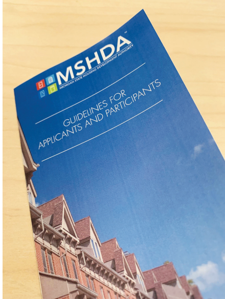
MSHDA brochure explaining applicant guidelines.