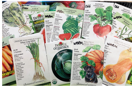
Packets of seeds we plan to grow this year.