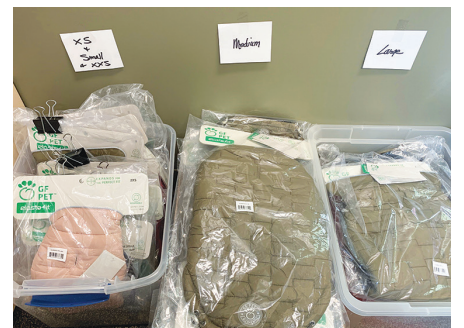
Pet coats organized into storage bins by size.

Thanks to a special grant from the Kalamazoo Community Foundation and the help of our friends at Bark’s 5th Avenue, we were able to purchase collars, leashes, and coats so our members could keep their pets safe and warm over the winter!