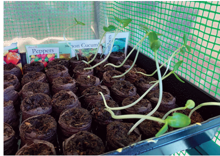
The cucumber seeds were some of the first to sprout!

Keep an eye on our social media for photos and updates!